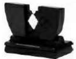
Standard Folding Sight (#69, #69H, #69EH)

Fixed Blade (No Step Elevator Adjustment)