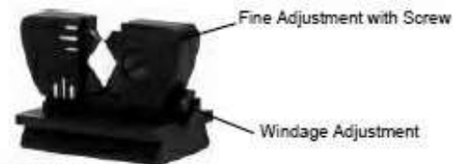
Flat Top with Windage Adjustment (#69W, #69WH, #69WEH)

Measure from bottom of Dovetail to bottom of "U" or "V" notch.